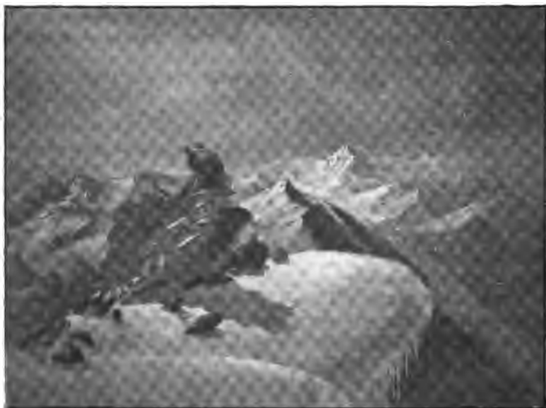
MIDSUMMER SNOWFIELDS LOOKING TOWARDS CHITRAL.

The people are all Mohammedans, and a great number of them belong to that Maulai sect who look to Aga Khan of Bombay as their