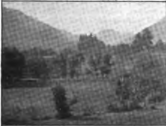
CHITRAL VALLEY, LOOKING SOUTH.

As I have said so much about the intelligence of these people in the science of war, I feel I ought, before changing the scene to Chitral, to say something of their aptitude for the arts of peace. Behind the fort at Baltit is a cliff beetling over a mountain torrent flowing down from the snow-peak in the background, and right along the face of this cliff may be seen a watercourse constructed there by the men of Hunza with but few other instruments than the curved horns of the ibex. Iron tools were until recently almost unknown in the country. Yet,