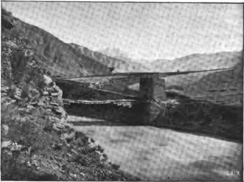
CHITRAL BRIDGE AND TIRACH MIR.

I soon began to see how fortunate I was to have such a pleasant-mannered, amenable prince to deal with, and during the long lonely